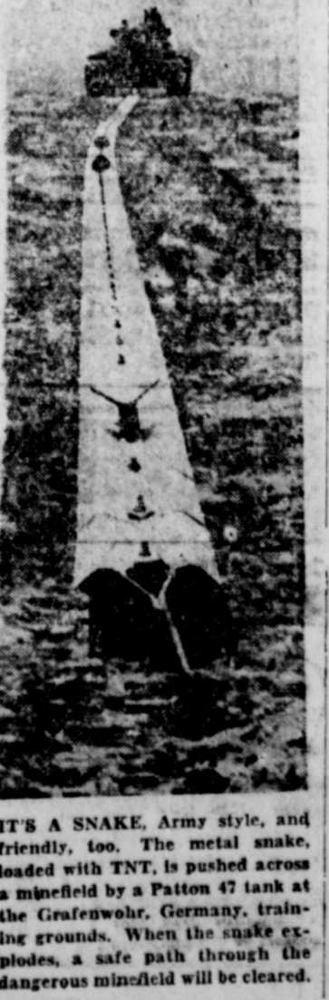
IT'S A SNAKE. Army style, and friendly, too. The metal snake, loaded with TNT, is pushed across a minefield by a Patton 47 tank at the Grafenwohr, Germany, training grounds. When the snake explodes, a safe path through the dangerous minefield will be cleared.

No reports have been heard from the sub-stations throughout the county, but the Tax Collector estimated that more than 2,000 persons in the county paid the tax this year.