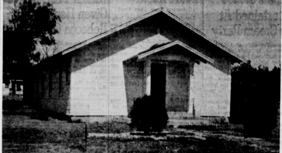
PENTECOSTAL CHURCH-The United Pentecostal Church was organized here in 939. Today there are 35 resident members and the church property is valued at $10,