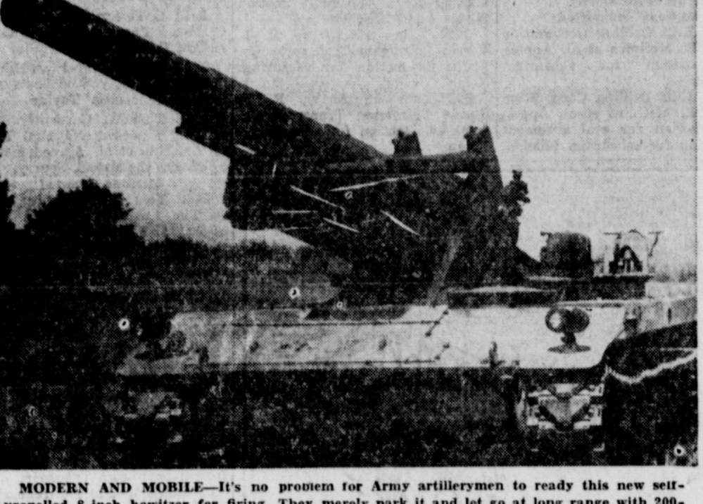
propelled 8-inch howitzer for firing. They merely park it and let go at long range with 200pound shells. The tracked carrier was designed to move at high speed across rugged terrain.