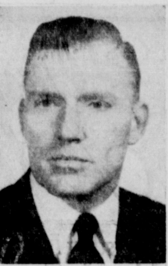
to conduct services