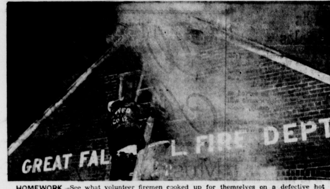
HOMEWORK -See what volunteer firemen cooked up for themselves on a defective hot plate in their headquarters at Forestville, Va. No injuries, but several cases of acute embar-rassment were suffered.

39 years in the Insurance Business In Eastland