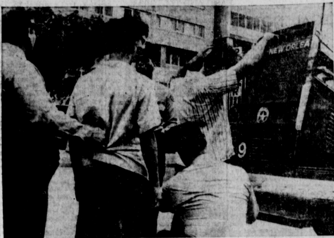
BREAKING UP THE CROWD —New Orleans, La., police search teen-agers as a police wagon stands by to take them to jail. They were picked up in an effort to control anti-integration violence at the city's schools.