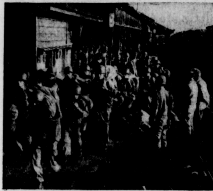
TOWARD THE FLAME—First troops of the U.S. Army to arrive in Korea ten years ago debark from trains prior to moving up front to brace the South Korean army. Heroic action by veterans, draftees, Reservists and National Guardsmen finally turned the tide in favor of United Nations forces—serving notice that Americans can, and will, resist aggression.

ATTEND THE CHURCH OF YOUR CHOICE EACH SUNDAY