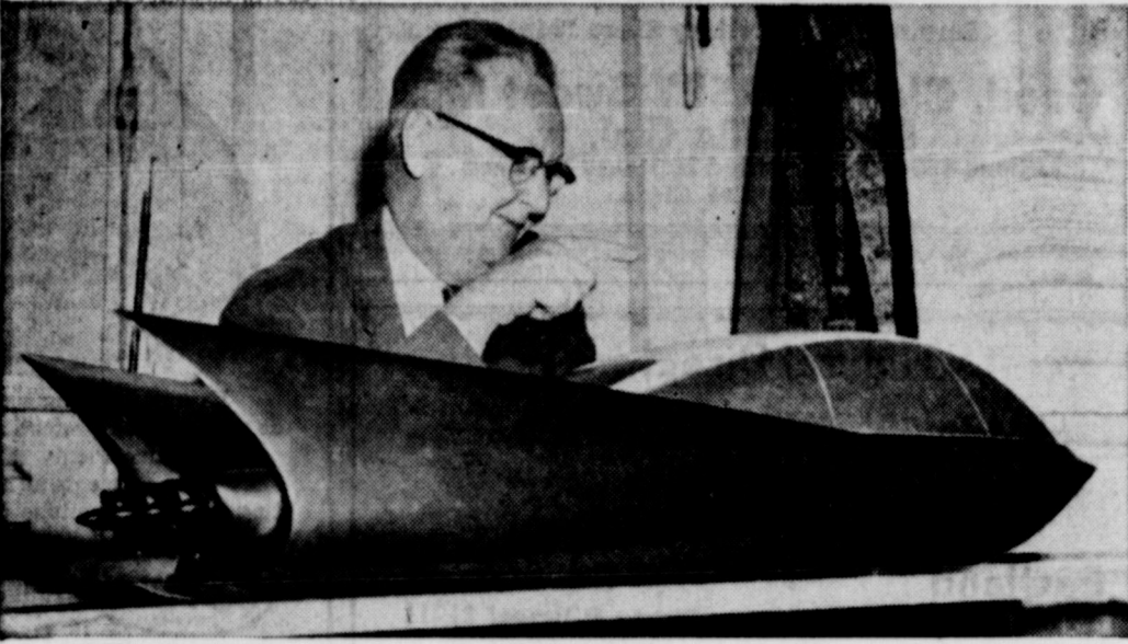
AIRBORNE GROUND VEHICLE —"Levacar" is the name of the strange-looking device being examined by House space committee chairman, Rep. Overton Brooks (D-La.), in Washington. One of several vehicles-of-the-future shown in model form to the space committee members, it rides on a thin cushion of air instead of conventional wheels. Predicted top speed: 600 m.p.h. Hose attached to vehicle at extreme left supplies compressed air to the working model. Self-contained blowers would do the job in the actual machine.