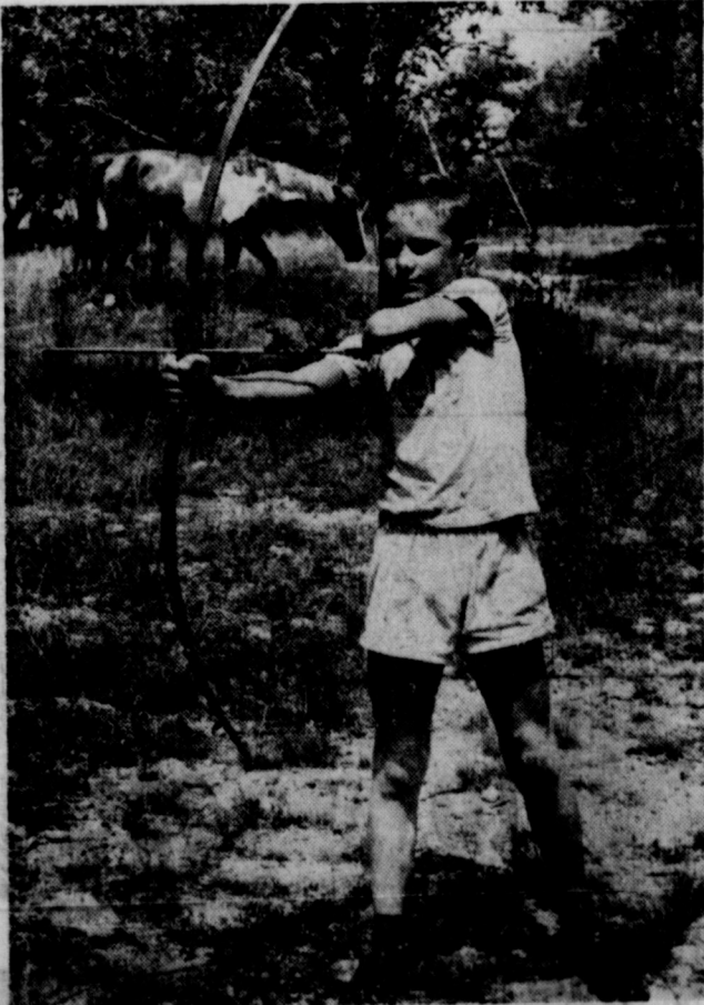
BULLSEYE — This youngster at the Texas Lions Camp for Crippled Children at Kerrville is learning the adventures of archery for the first time at the unique camp, which is free to any eligible handicapped child in the state between 7 and 14.