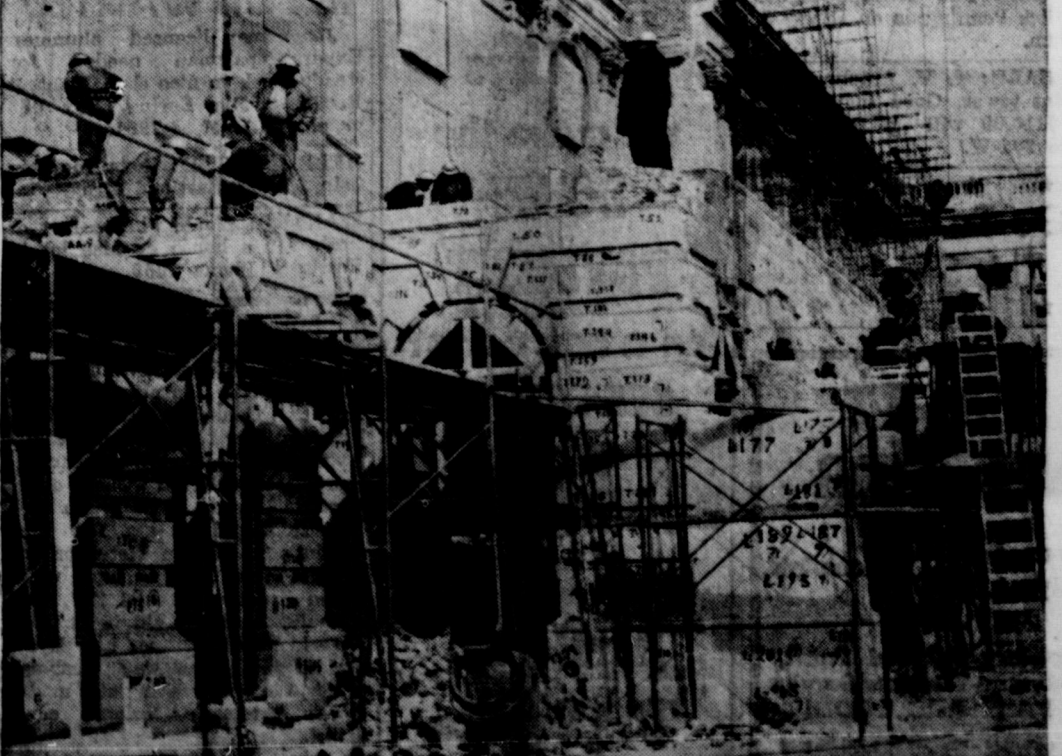
BIG BOYS' BUILDING BLOCKS — Covered since about 1822, arches once a useful part of the nation's Capitol are revealed during extension of the east front of the building. They had been hidden by a stair well. Each block of stone has been numbered according to a master plan. Arches may be set up elsewhere some time in the future, perhaps as a historica

The current year is the first time the homes' budgets have exceeded $2,000,000 for operation expenses. Capital expenses will push the final figure to $2,800,000 that the homes will spend in (Continued expenses.)