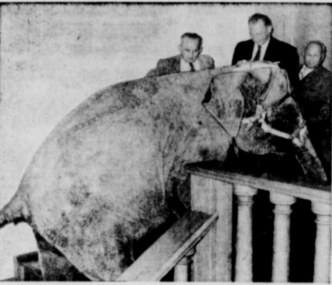
TAXES THE IMAGINATION —"Mickey," the circus elephant, trudged up these stairs in the town hall of Augsburg, West Germany, to deliver a trunkful of amusement tax from circus admissions. That's what the man said who took this picture.