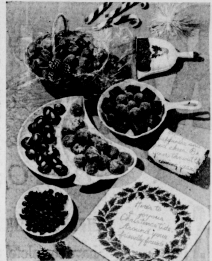
Christmas gifts of mouth-watering, homemade chocolate candies take on added attractiveness with clever packaging.

Three-quarters pound (48) marshmallows, 1/4 cup butter or margarine, 1/2 cup water, 1/4 teaspoon salt, one 6-ounce package (1 cup) semisweet chocolate morsels, 1 teaspoon vanilla, 1 cup chopped nuts (optional). Combine marshmallows, but-