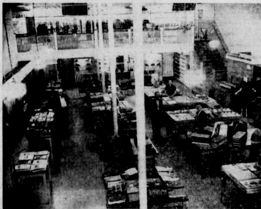
HARELIK'S DEPARTMENT STORE —This interior shot of Harelik's department store shows the different departments of the store and also reveals the remodeling job done on the old J. C. Penney Co. building. Harelik's will feature clothing "for the entire family." Many door prizes will be given away during the grand opening.