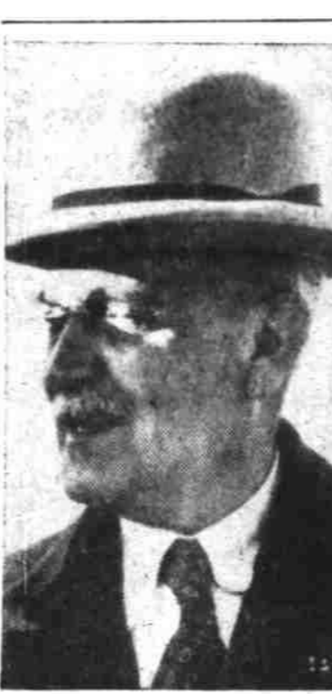
NAMED ON DEATH LIST - Greek police announced that the name of Gen. Stylianos Gonatas (above), leader of the Liberal Party and former premier, was on the death list named in connection with a plot to assassinate prominent political leaders.