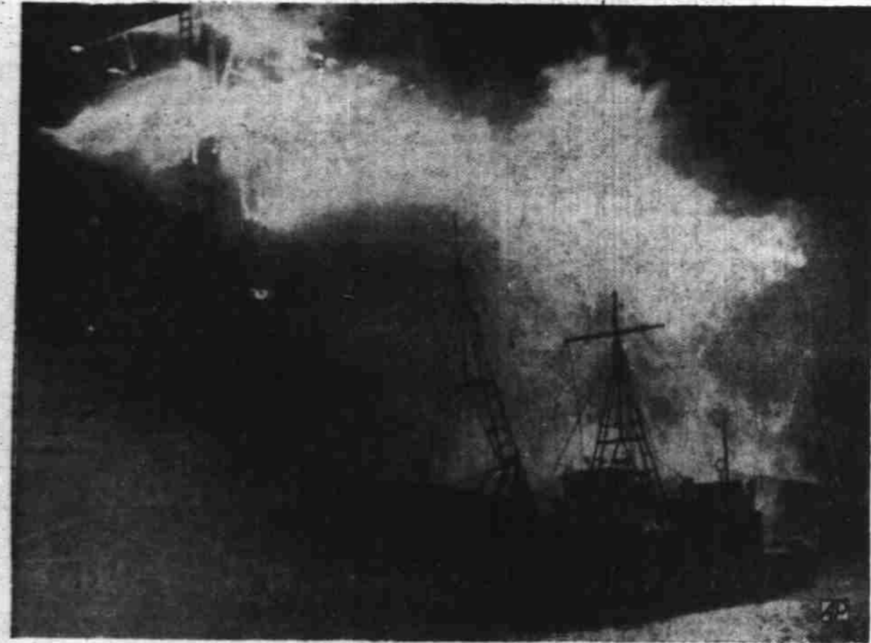
COAL WHARF BURNS - The Union Wharf coal plant burns in Portland, Maine, backlighting the fishing trawler Jeanne D'Arc. Coal hoisting tower at top left collapsed on the fishing vessel. Loss in the fire was estimated at about $225,000. (AP Wirephoto).