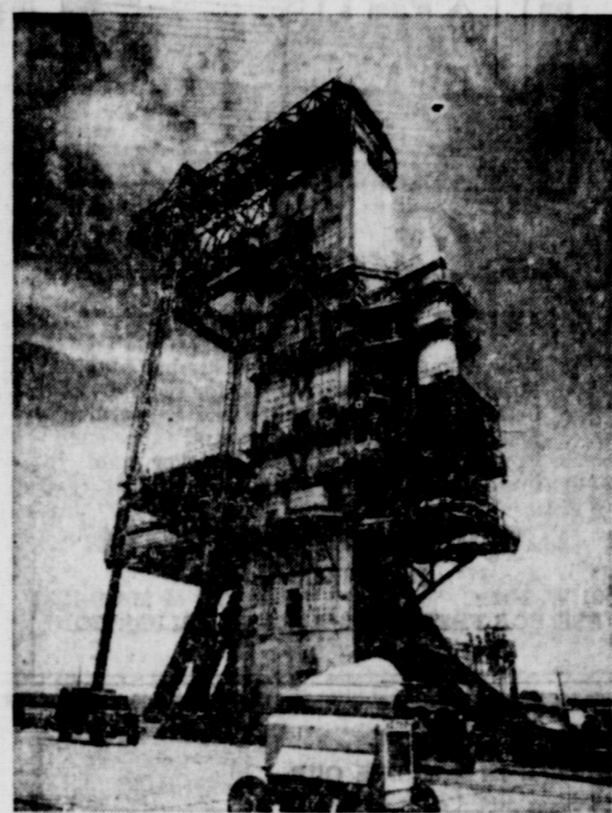
SATURN TEST POWER ready for the first static firing of the massive 1,500,000-pound thrust Saturn booster. Of gigantic size and unique design, the 175-foot high tower was previously 147-feet in height and was used in the testing program of the Redstone and Jupiter missiles. The Saturn booster is being developed by the Army Ballistic Missile Agency's Test Laboratory at Redstone Arsenal, Alabama. It is the first stage of a multi-stage space vehicle capable of placing very heavy payloads into earth orbit or effecting a "soft" lunar landing.

There are also four candidates in the school election at Carbon. They are Mack M. Stubblefield,