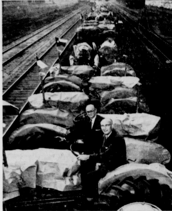
TEXAS BOUND —Texas farmers now are receiving Ford diesel tractors from the largest single shipment ever delivered in the state. Two Ford Motor Company officials are shown inspecting the special train load of 255 diesel tractors as it recently left Dearborn, Mich. for The Stewart Company in Dallas, distributor of Ford farm equipment in Texas.