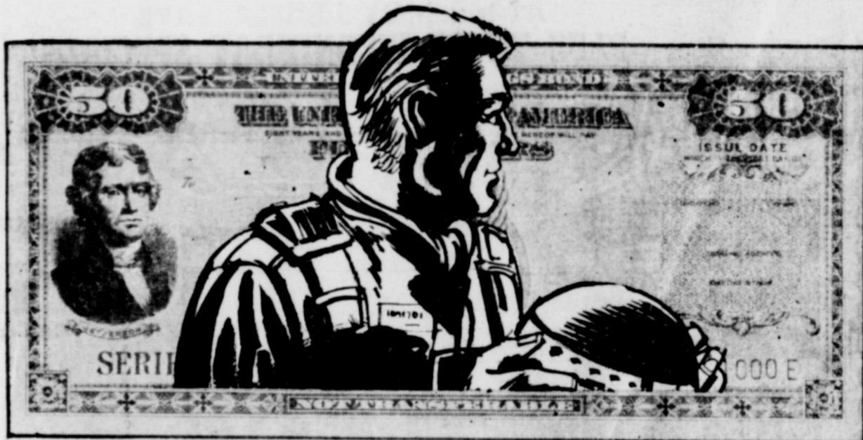
It takes money to keep our jet pilots up there patrolling the skies. . . .