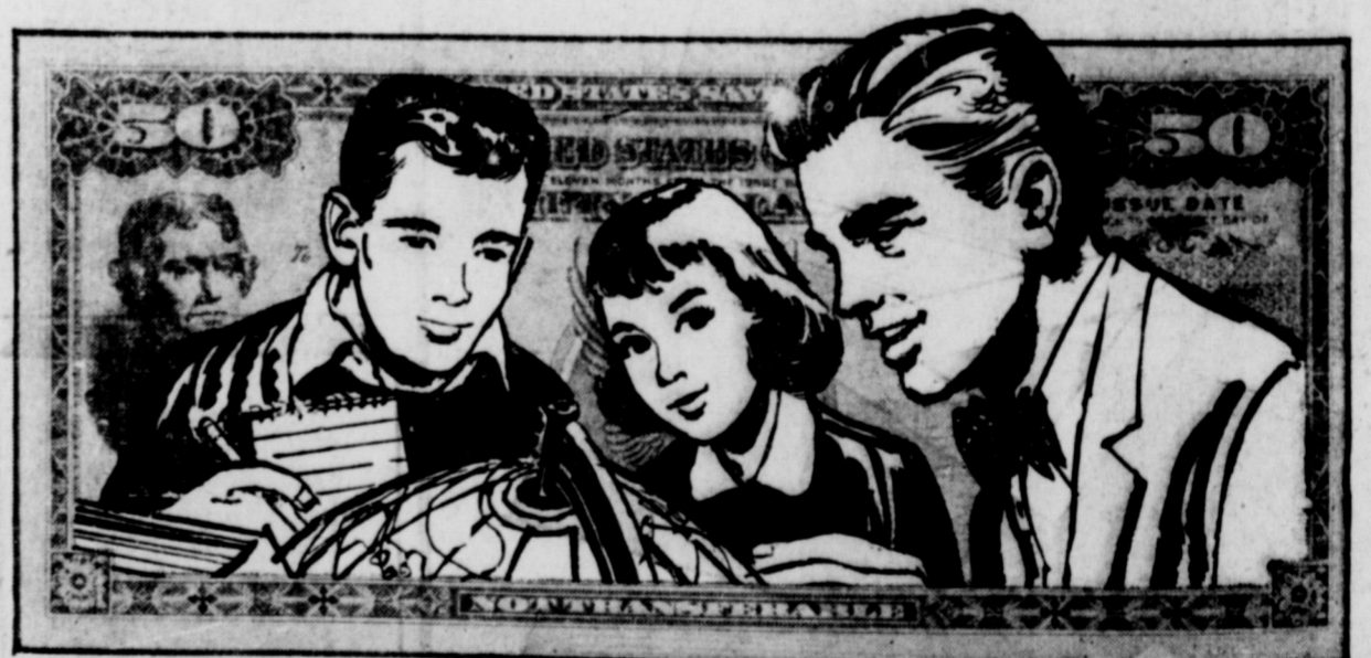
Money to help our children learn how to make peace lasting.