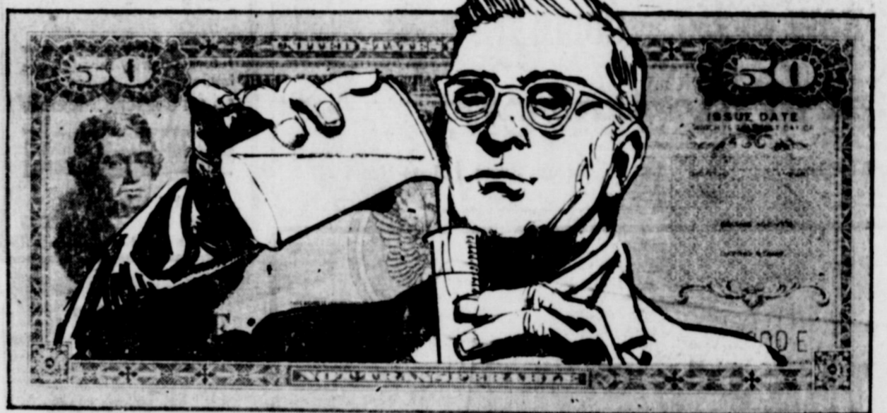
Money to let our scientists continue their search for answers. . . .