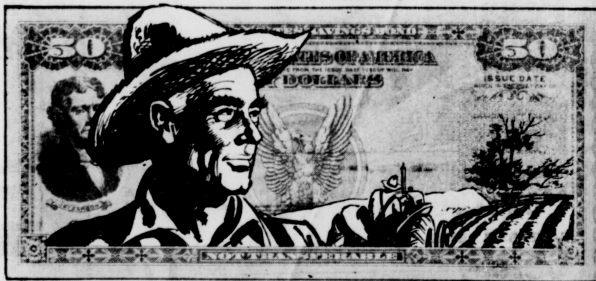
Money to insure that our productive power will thrive and grow. . . .