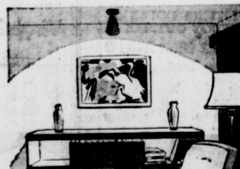
LIGHT adds dramatic highlights. A spotlight or lighted wall bracket directs attention where you want it.