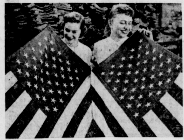
LAST TIME AROUND - This is the last Fourth of July that the familiar United States flag—with 48 stars—will float above Eastland, it appears.

A water carnival, jointly sponsored by the Eastland and Ranger chambers of commerce, is expected to attract hundreds of Fourth of July fun seekers to Lake Leon Thursday and Friday.