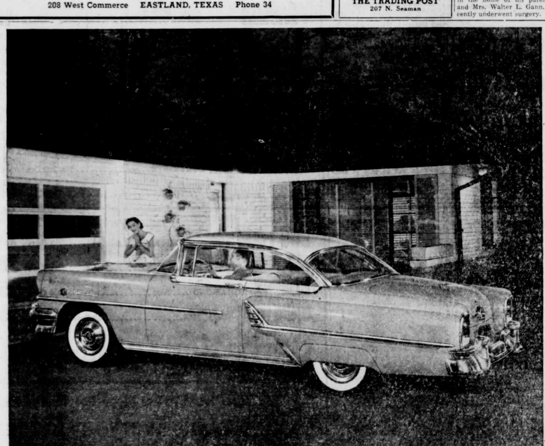
from-all with new SUPER-TORQUE V-8 engines. There's the new ultrasmart 198-horsepower Montclair series (hardtop shown above), the