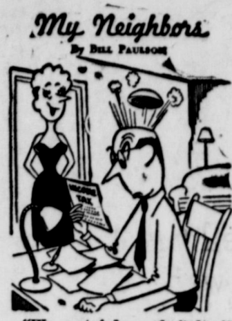
"We certainly can't take it with us. The Government takes it first!"