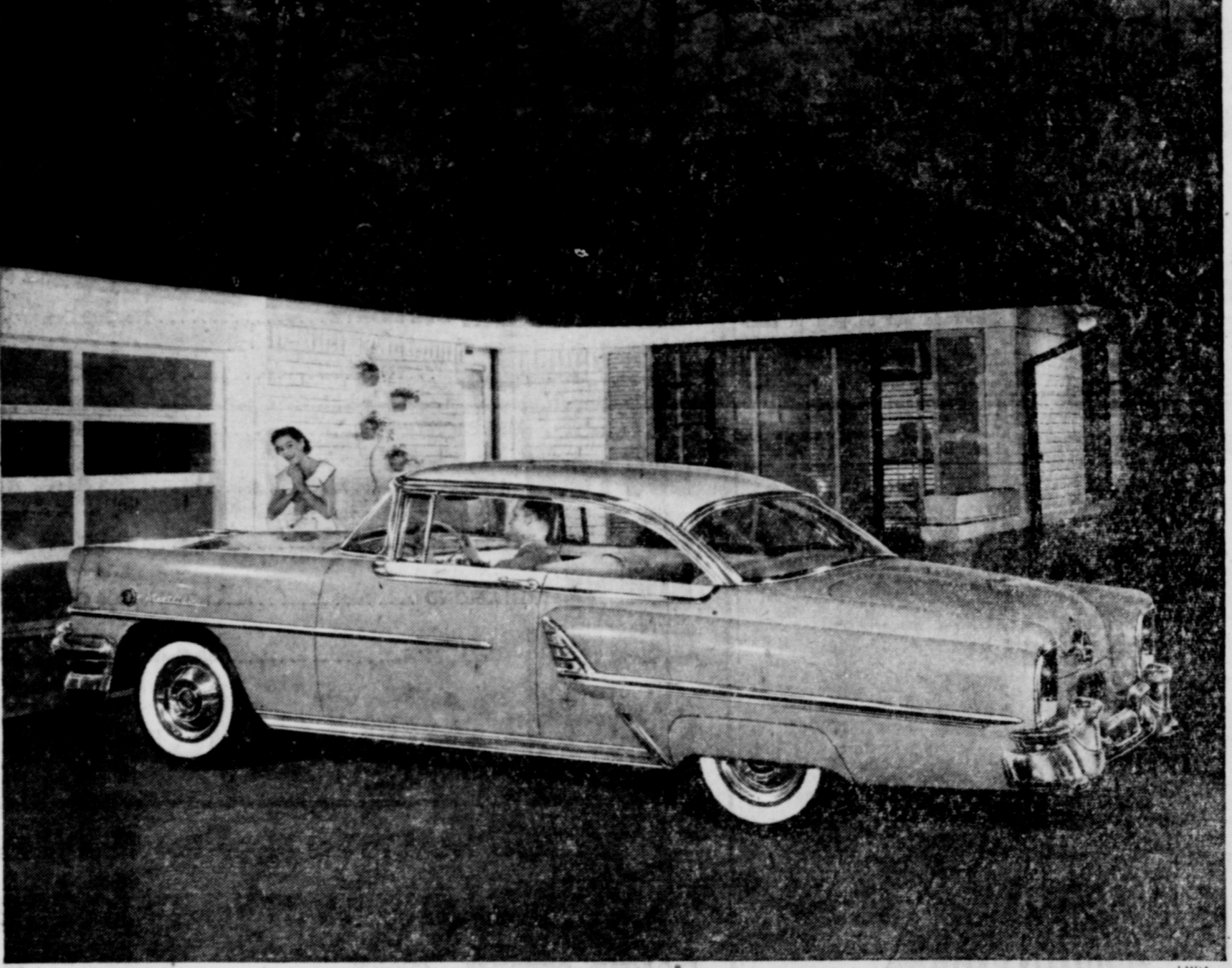
Mercury offers you 11 models in 3 price brackets to choose from—all with new SUPER-TORQUE V-8 engines. There's the new ultra-smart 198-horsepower Montclair series (hardtop shown above), the ever-popular 188-horsepower Montereys, and the lowest-cost 188-horsepower Customs. And no matter what model you choose, you are sure of Mercury's exclusive styling—shared by no other car on the road today.

See us during lunch hour—drive a Mercury home that night