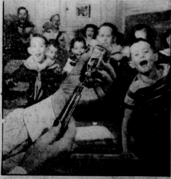
Enlist your children in the growing army of youngsters which is being railied behind the shield and sword—hypodermic and vac-cine—that they may march safely and happily throughouthe years in which polio might otherwise claim them as victima.

Don Pierson Olds - Cadillac Eastland, Texas