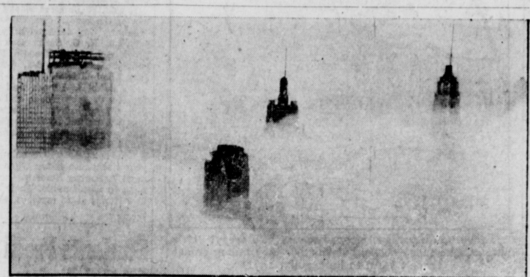
CLOUD CITY—Dense fog which rolled in on the wake of a two-day rain hides everyday Chicago, Ill., turns it into a fairytale city of castles in the clouds. Ruined battlements, at left, are in actuality upper works of newest addition to the usually Windy City's skyline; the nearly completed