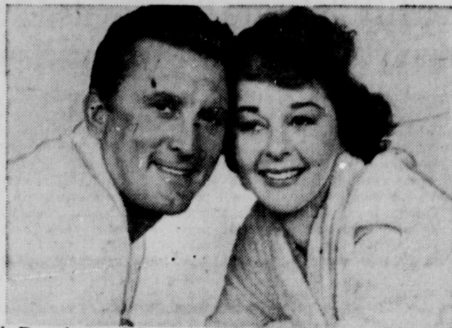
Kirk Douglas and Susan Hayward get their heads together in the interest of romance, in Warner Bros. "Top Secret Affair." After she gets him over a barrel strictly for those enjoyable laughs.