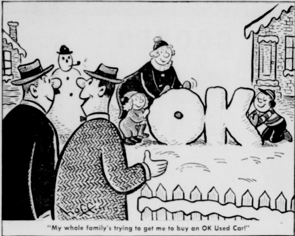
"My whole family's trying to get me to buy an OK Used Car!"

more convenient for applicants who live in outlying areas to come for information and processing without interrupting their mid-week activities," he said.