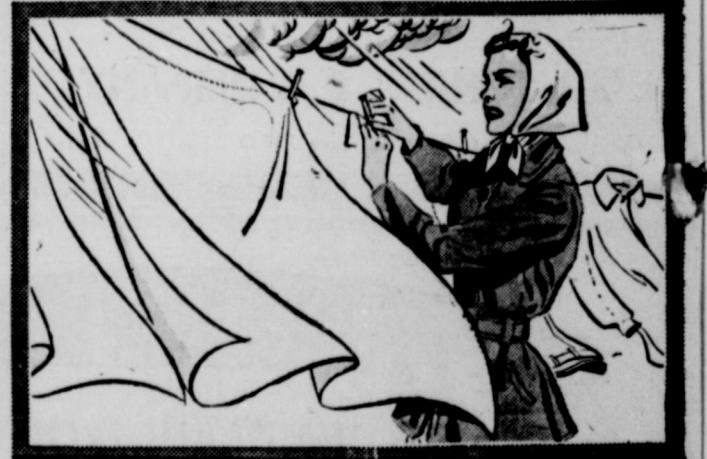
You can forget winter's cold and summer's heat... dry clothes in comfort any time... electrically!

You're freed forever from washday weather worries when you have an Electric Dryer. No more letting dirty clothes pile up while you wait for a change in the weather. No more shivering in icy winds or baking in the hot sun while you hang clothes on the line. With an Electric Dryer, you can dry clothes on schedule and in comfort... anytime. Your clothes will come out cleaner, softer and fluffier... dried in gentle electric heat... at the turn of a dial! Drying clothes electrically is one of the nicest things about living better... electrically.