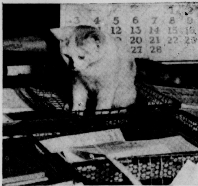
PUSS-IN-PROOFS —An extra copyreader at the Columbus (Ohio) Citizen carefully scrutinizes papers on the city editor's desk. Editorial workers discovered this cat, named "Nosey," sitting in the basket and looking glum about the general state of world affairs.

Still others have contributed greatly to the promotion of driver education. The Texas Safety As-