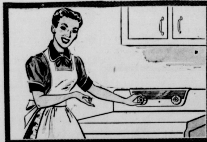
No matter how disagreeable the weather, you can dry clothes on schedule with an Electric Dryer.