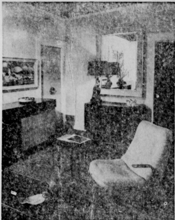
FOR A LAST LOOK before going out, a mirror hangs judiciously near the doorway. Framed in marble tiles ranging in color from light beige to the rosy hues, the mirror also adds a decorative touch to the room. Fine mirrors like this have a new degree of perfection for reflecting images through an advanced Libbey-Owens-Ford technique of twin-grinding the plate glass that goes into them, according to interior designers.