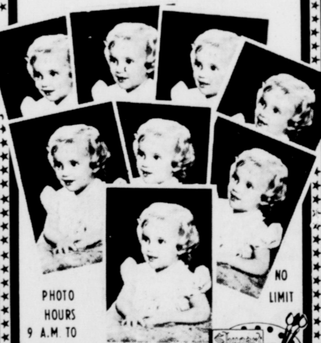
PHOTO HOURS 9 A.M. TO CLOSING

KING SIZE WALLET CREATIVE COLOR PORTRAITS FOR ONLY