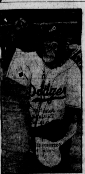
DON'T MONKEY—Mascot Charlie Chimp calls for one right over the plate—low—as the Brooklyn Dodgers begin spring training at Vero Beach, Fla. This is about all the monaround you'll see all by the Dodgers, the to beat" in the National

The Car With The Forward Look DODGE FOR '55 McGRAW MOTOR CO.