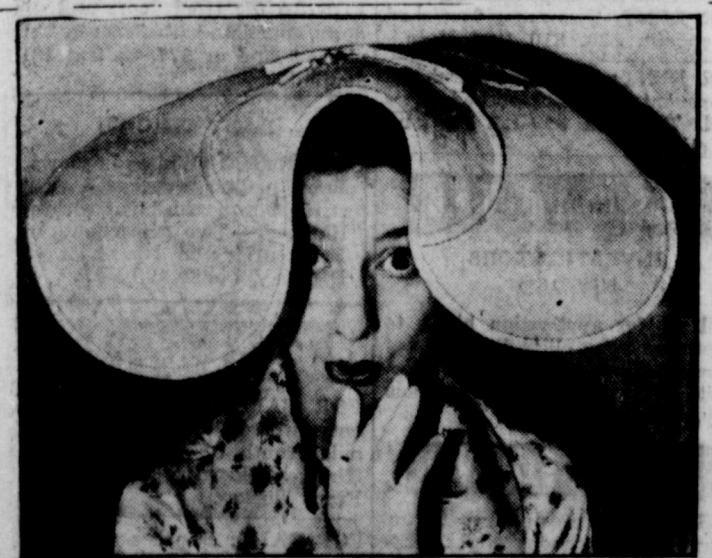
DON'T LAUGH. FELLOWS-The little lady may arrive home The lightweight picot original is being modeled in Paris. France.

Your New Car Financed At Low Bank Rates With Your-EASTLAND NATIONAL BANK Member F. D. I. C.