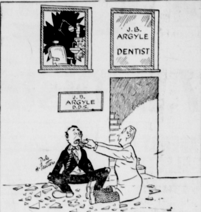
"That's one stubborn tooth!"