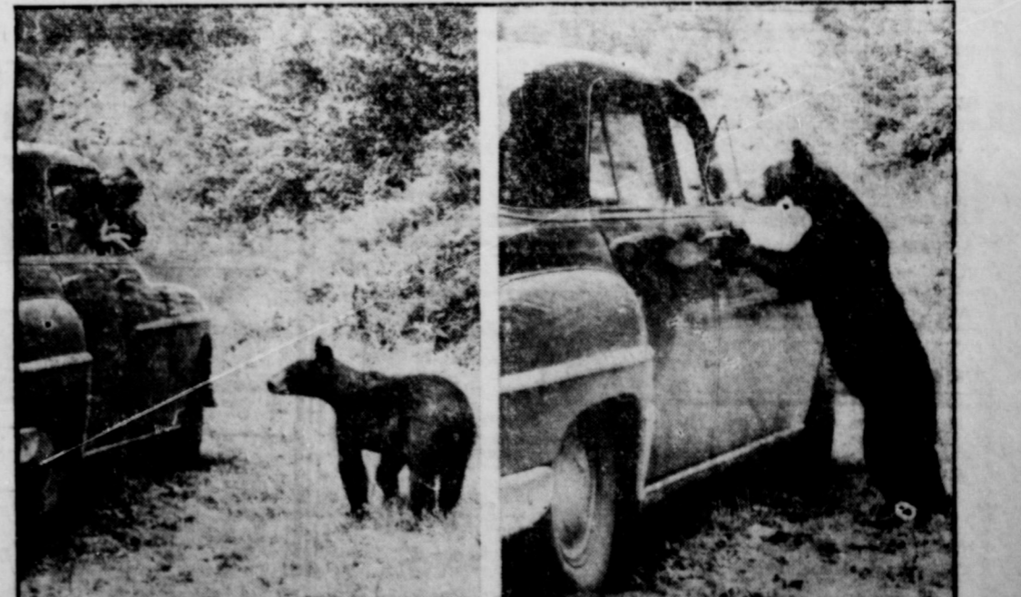
COULDN'T BEAR IT — The camera-focusing tourist, left, was delighted to be able to take a moving picture of this black bear in the Great Smoky Mountains of North Carolina. But when the animal proved to be a ham at heart and moved in for a close-up, the lady ducked — the empty car window at right shows

Your New Car Financed At Low Bank Rates With Your— EASTLAND NATIONAL BANK Member F. D. I. C.