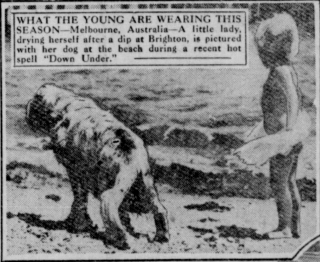
WHAT THE YOUNG ARE WEARING THIS SEASON—Melbourne, Australia—A little lady, drying herself after a dip at Brighton, is pictured with her dog at the beach during a recent hot spell "Down Under."