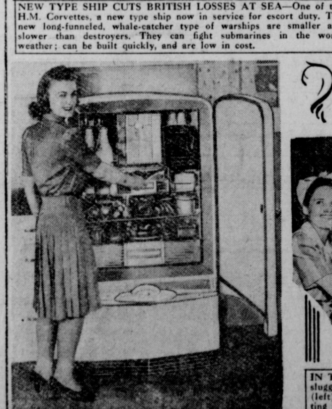
RESEARCH FOR HEALTH—American industry, world-famous for its research, has now developed a home electric refrigerator as effective as that used in modern markets with varied zones of "true temperature control." This is cited by the Crowell-Collier Industrial Service as typical of what industrial research is accomplishing for the consumer.