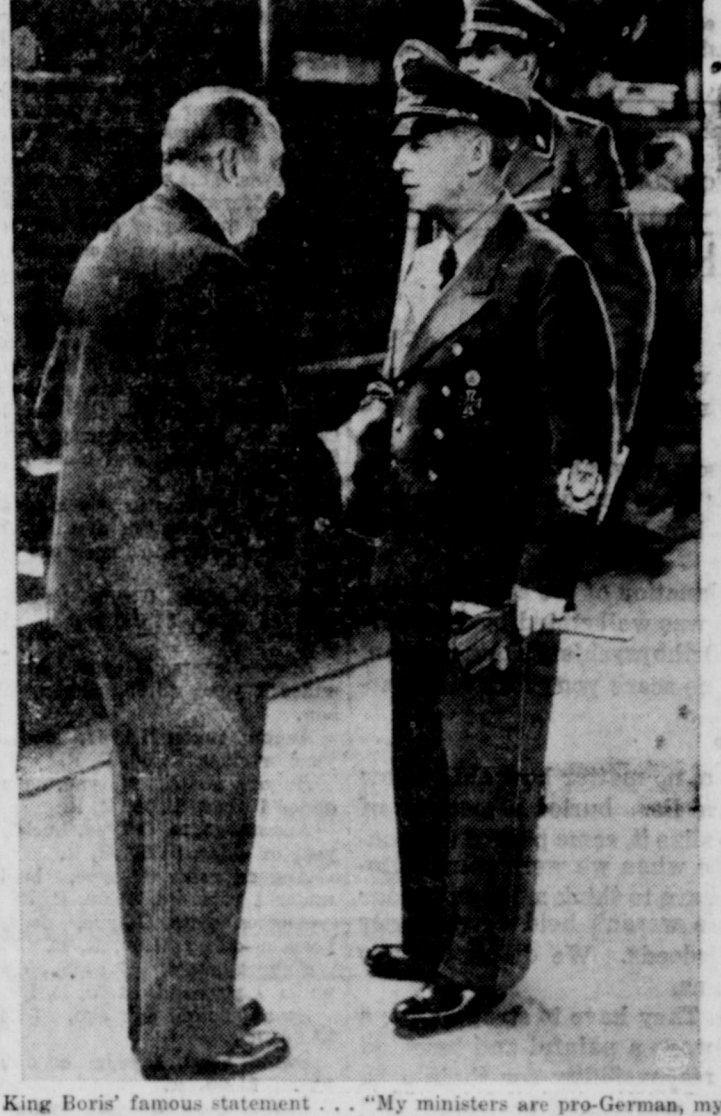
King Boris' famous statement... 'My ministers are pro-German, my wife is pro-Italian, my people are pro-Russian—I am the only neutral in the country'...