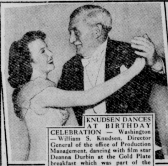
KNUDSEN DANCES AT BIRTHDAY CELEBRATION—William S. Knudsen, Director General of the office of Production Management, dancing with film star Deanna Durbin at the Gold Plate breakfast which was part of the President's birthday celebration.