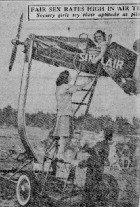
FAIR SEX RATES HIGH IN AIR TEST—Society girls try their aptitude at pilot