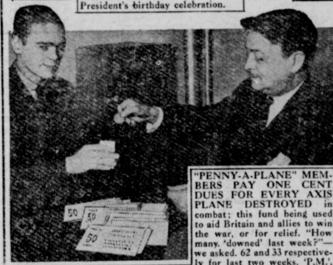
"PENNY-A-PLANE" MEMBERS PAY ONE CENT DUES FOR EVERY AXIS PLANE DESTROYED IN combat; this fund being used to aid Britain and allies to win the war, or for relief. "How many 'downed' last week?"—we asked. 62 and 33 respectively for last two weeks, "P.M."