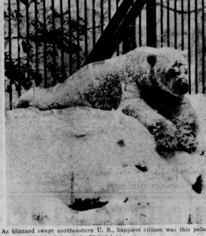
As blizzard swept northeastern U. S., happiest citizen was this polar bear at the Philadelphia zoo.