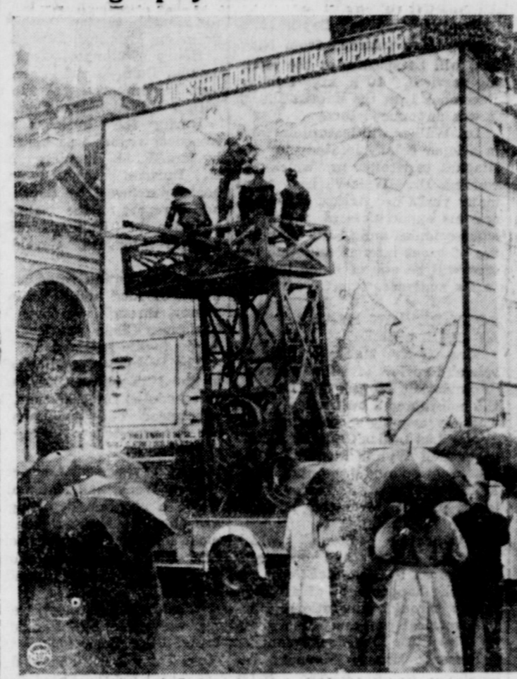
Il Duce made an embarrassing mistake of putting his cartographers ahead of the Italian warhorse when he ordered this huge map displayed in Rome's Piazza Coenna at beginning of the invasion of Greece. It shows Greece conquered, already incorporated into Greater Italy.