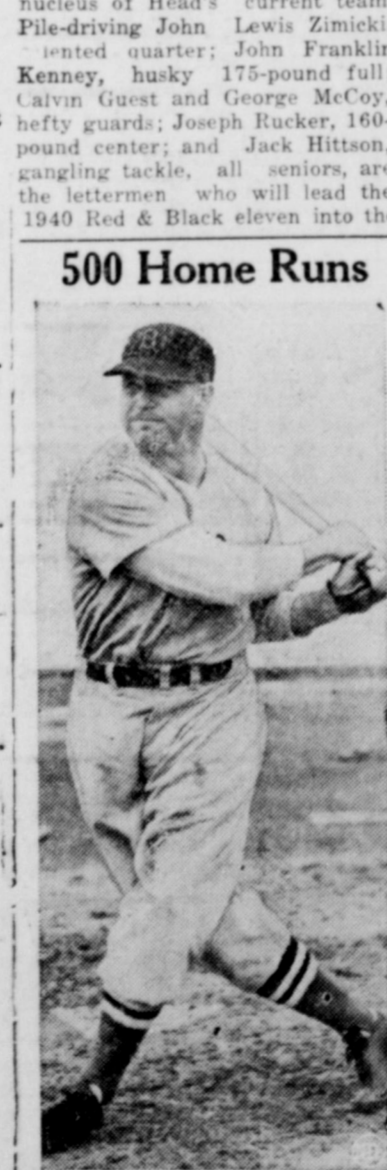
Jimmy Foxx's next home run—the 36th this season—will be the 500th of his American League career. Only one other player manufactured as many—Babe Ruth, who hit 714. Foxx, versatile star of the Boston Red Sox, hopes to be around long enough to break the Bambino's mark.