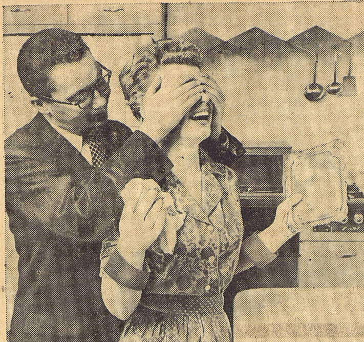
Even a gag or two doesn't upset this hard-working housewife. Polishing the silver with protective gloves eases worry about rough, red hands.

In addition to using the gloves, keep a bottle of hand lotion on your kitchen shelf and use it liberally as you finish each task.