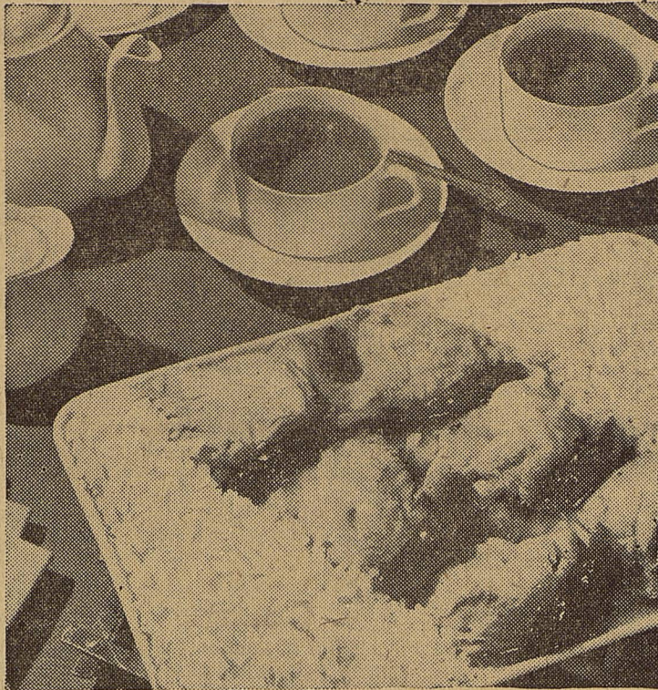
Platter of appetizing chicken curry, topped with a cup of tea, add up to mealtime pleasure. More and more Americans like the tea idea.

TODAY, more and more women are making hot tea their mealtime beverage. The reasons vary, according to spot interviews with homemakers across the country. Some say tea as a mealtime beverage has gained in popularity in their homes since they've learned to make it the way their husbands like it best—strong and full-bodied. Others say they serve tea with meals because it's light and refreshing—just right after a heavy meal. Whatever the reason, we have it on sound authority that tea consumption has increased 24 per cent since 1949 in the United States. Our own belief is that one of the basic reasons for the increased popularity of tea at mealtime is the fact that more women are making tea according to the experts' Four Golden Rules: (1) always use a tea pot, (2) use fresh bubbling, boiling water, (3) use 1 teaspoonful tea or 1 tea bag per cup and (4) brew 3-5 minutes.