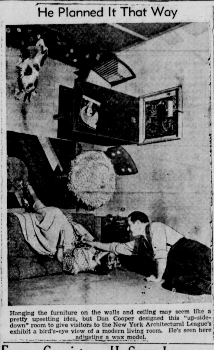
He Planned It That Way

Announcing they were strongly opposed to the anti-lynching bill before Congress, members of the Association of Southern Women for the Prevention of Lynching mapped an eight-point program at their meeting here to: