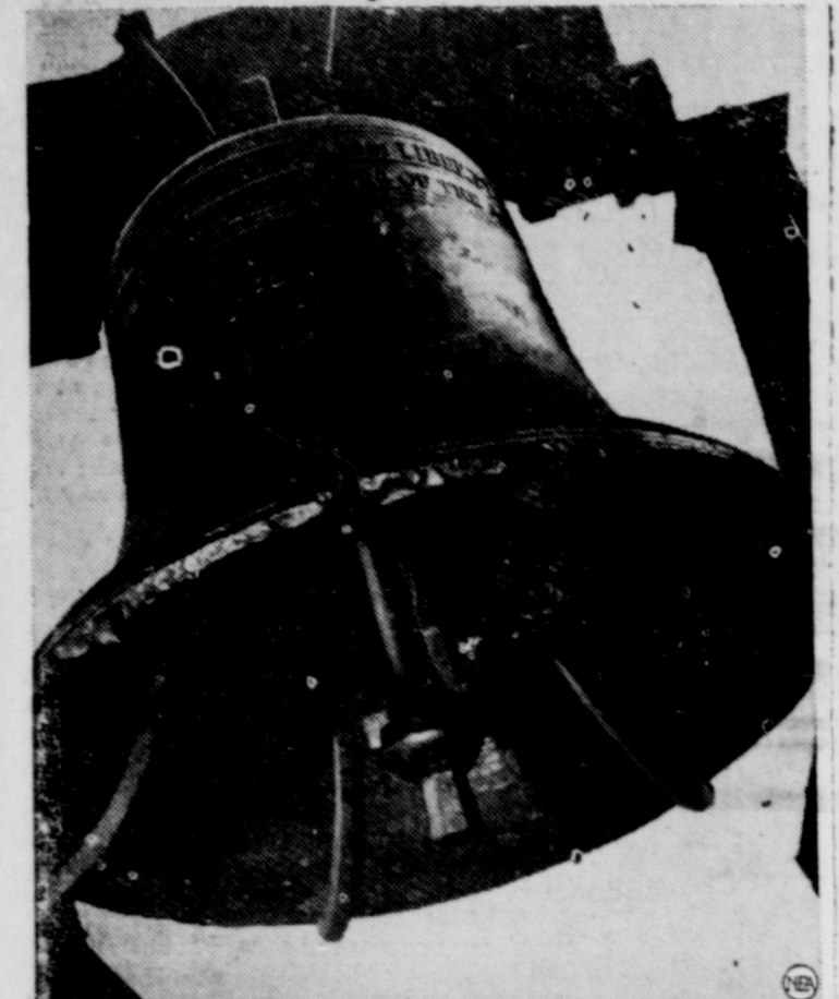
LISTEN! A BELL IS RINGING!

All day, from the early morning, the streets of quiet old Philadelphia were filled with a throng of people. Earnestly they talked in little groups, but ever their eyes swept back to the door of the state house. There the Continental Congress was meeting.