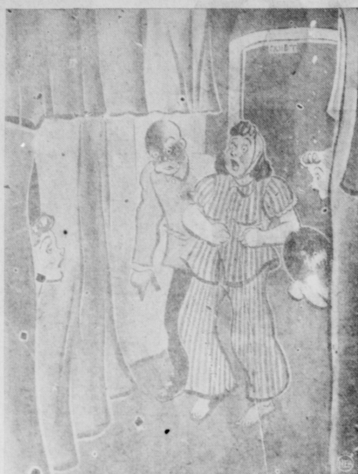
The scream was followed by another. Groggily, Denny stuck his head between the curtains. In the aisle, a stout, pajama-clad woman was clawing at her middle.

"Don't be scared! It's only there it is! Stop jumping! It's out. See? Step back, Madam. And