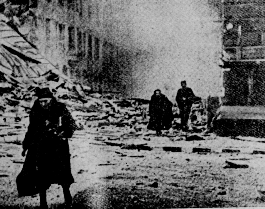
and driven, a woman of Helsinki, Finland, flees through debris-strewn streets during a Soviet bombing raid on the Finnish capital.