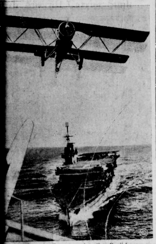
aircraft carrier Courageous in action. English announce been sunk by submarine, which in turn, is believed to destroyer. Courageous weighed 22,500 tons, carried