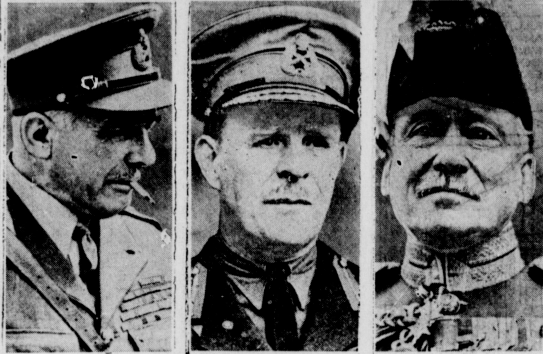
Responsibility for the success of British armed forces at home and abroad rests upon the three men pictured above. General Sir William Edmund Ironside, left, is supreme head, being chief of the Imperial Defense Staff. Expeditionary armies on the continent are headed by Viscount John Standish Gort, center, while commander-in-chief of the home forces is Sir Walter Kirke, right.