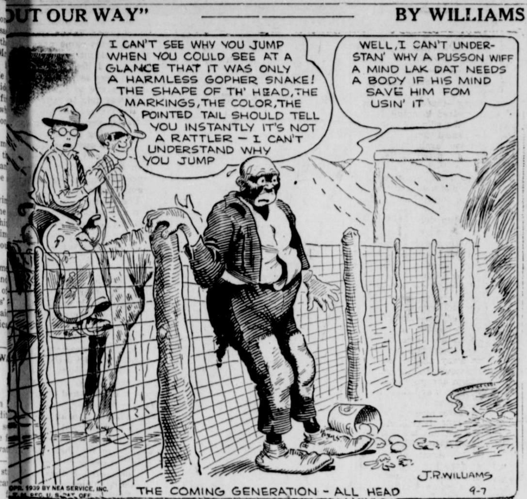
THE COMING GENERATION - ALL HEAD 9-7