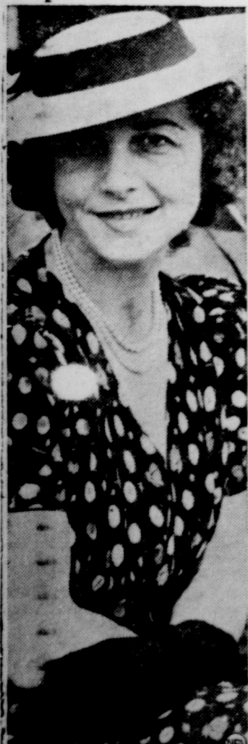
Apparently definitely through with "competition" at last, Mrs. Helen Wills Moody, famous tennis champion, adds attractiveness to eastern galleries this season.