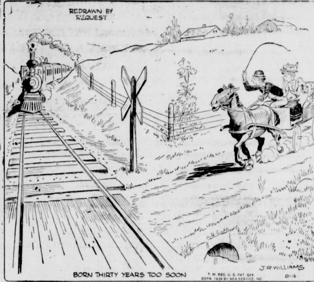
REDRAWN BY REQUEST