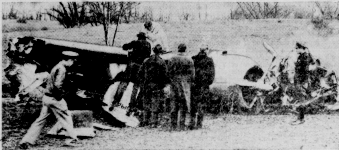
Three U. S. army officers miraculously escaped death when an all-metal, nine-ton bombing plane crashed, above, near Wright Field, Dayton, O. The $500,000 warship crashed during test flight. The occupants climbing from the wreckage before the craft burst into flames.