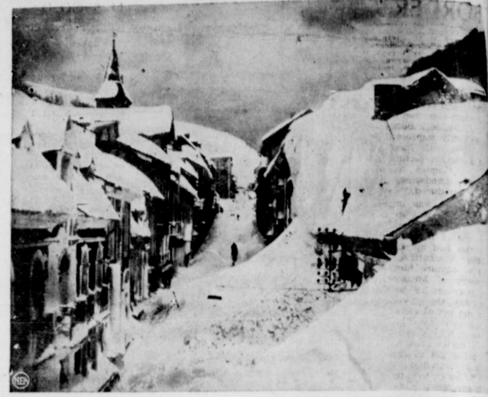
Buried in snow which came thundering down the Pyrenees mountains, the village of be France, is pictured in burial shroud. The slide killed 28 townspeople, kept others snowbo