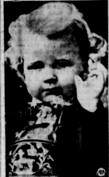
The little Prince of Naples, son of the Prince of Piedmont, heir to the Italian throne, and the Princess, donned peasant costume, above, while at Val Gardena, Italian winter resort.