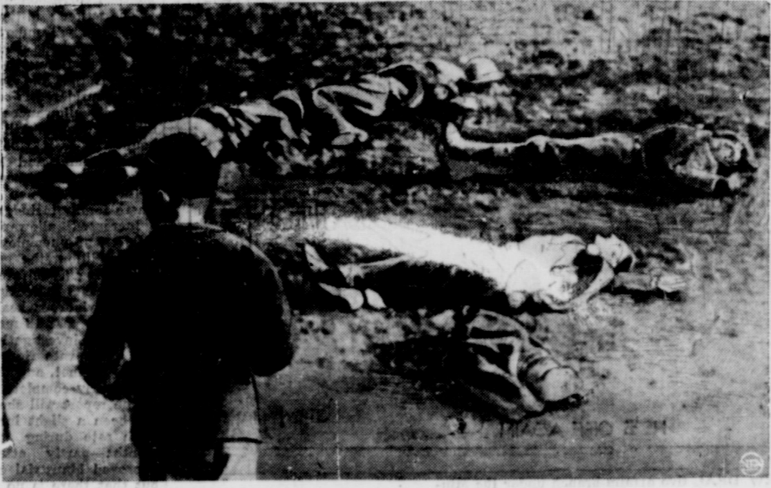
The price of Adolf Hitler's sudden map-changes: Ruthenians shot and strewn on the ground near Chust, capital of Ruthenia, after they had resisted invasion by Hungarian troops.