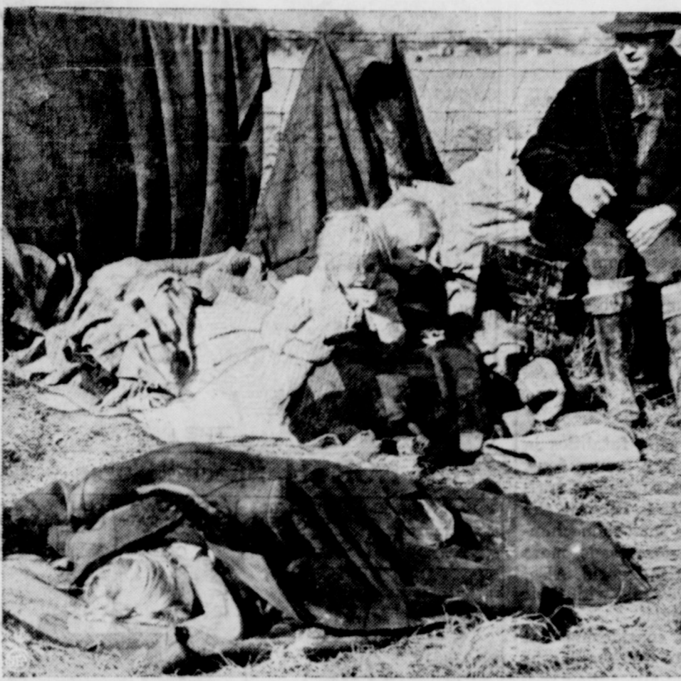
Huddled among household goods along highways of New Madrid county, Mo., more than a thousand sharecropper families like that pictured above are homeless as a result of mass evictions by land owners whom tenants charge seek government crop reduction benefits for themselves. Planters recalled the roadside squatters were part of a C. I. O. "demonstration."