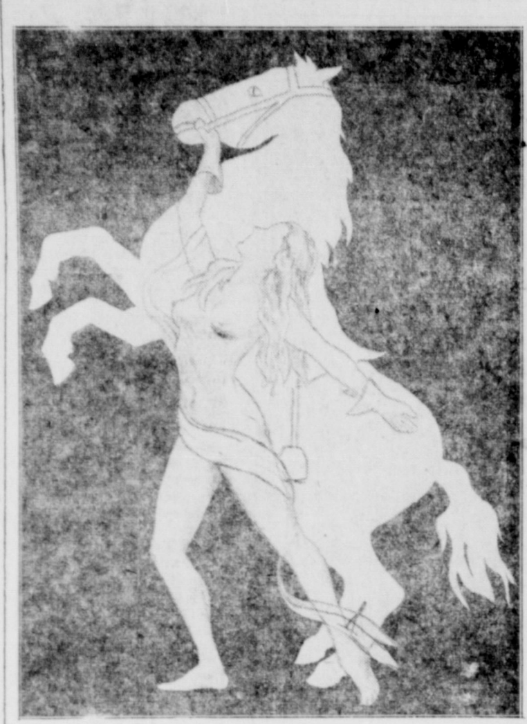
"Lady Godiva" and The famous white steed will appear on the stage banks in "The Young In Heart" with the Musical Ramblers at the Connellee's New Year's Eve midnight at Lyric Friday and Saturday show. The screen attract on will be 'Men I ith Wings." I on't m. this snow: It's all for fun and all in fun. All seats zoe