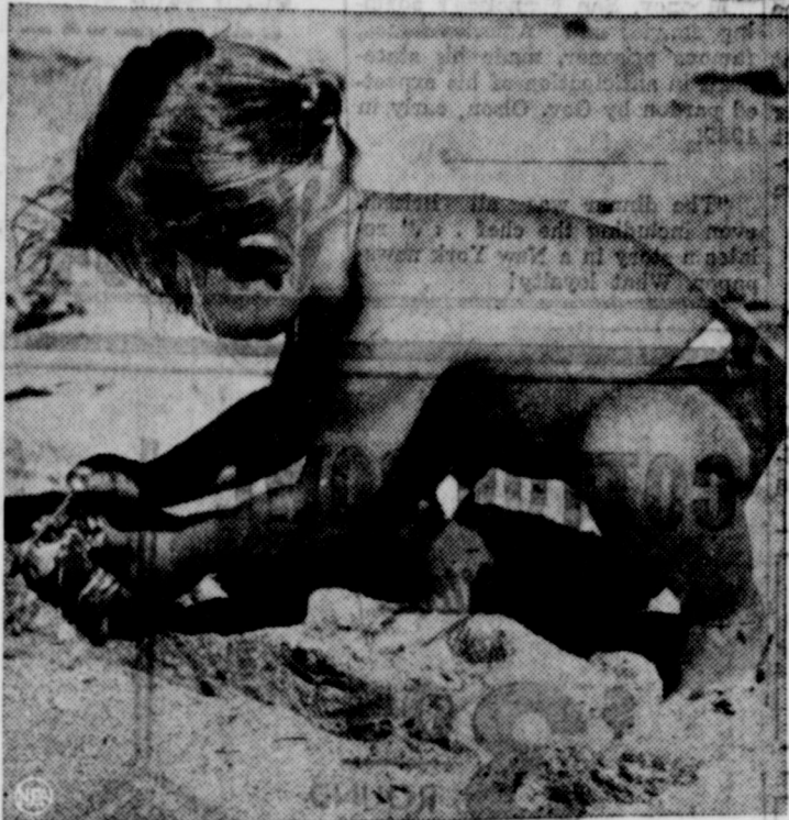
Snow, slush and such don't bother Ann Compton playing barefoot on Florida beach while you perhaps are freezing to death.