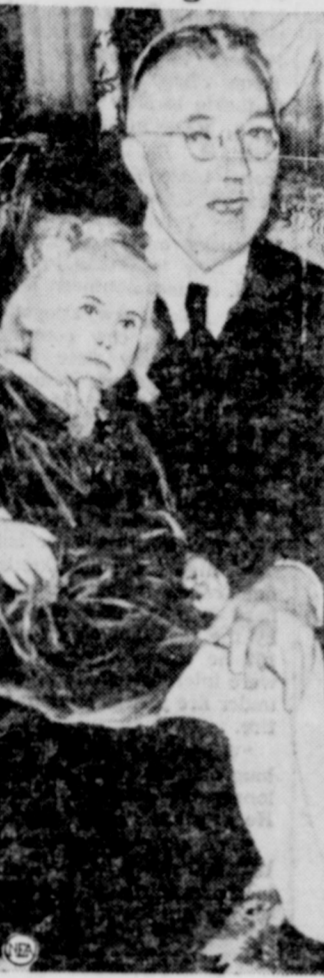
Reichsbanker Hjalmar Schacht, who goes to London to further Nazi plans for removing Jews from Germany, is pictured with his granddaughter. One rich Jew and four poor ones would be freed as a single economic unit.