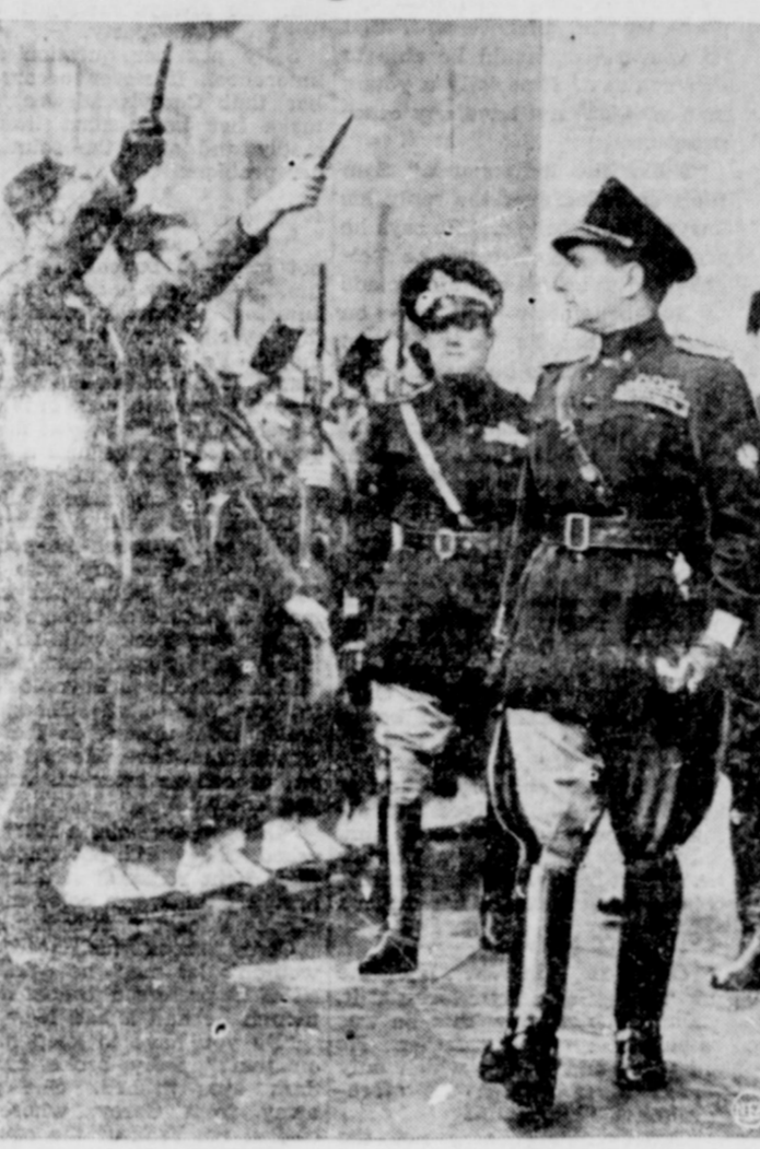
General Achilli Storace, right, Fascist party secretary, who seeks to purge Italy of 'servile greetings' and other middleclass customs, receives an approved dagger salute in Milan.