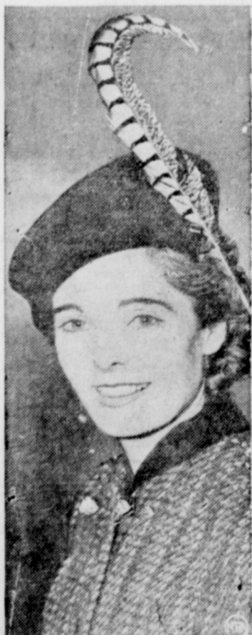
It was pretty much an international affair when English tennis star Kay Stammers, above, wearing a chic Scotch bonnet, left America's shores for home on the French liner Normandie. Miss Stammers had just completed extensive tournament play in the United States.