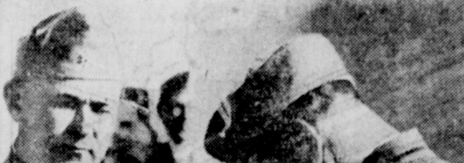
Bulgaria's King Boris III, shown at right in this new picture from Sofia ...