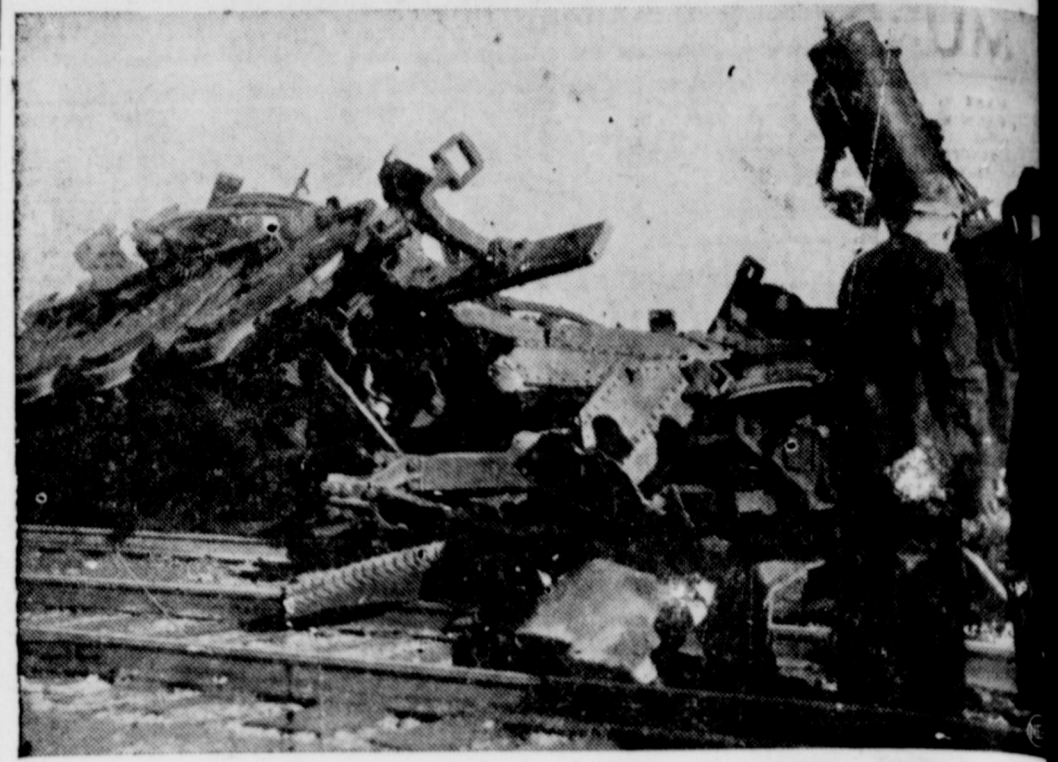
Three men were killed, the boiler was hurled 300 feet, rails were torn up and a great hole dug in the road bed when a railroad locomotive exploded between Elgin and Altona, Ill. The above picture shows the tangle of twisted and broken metal that was left when the locomotive of the Chicago, Milwaukee, St. Paul & Pacific railroad let go with a roar. A fireman, an engineer and a brakeman died in the wreckage.