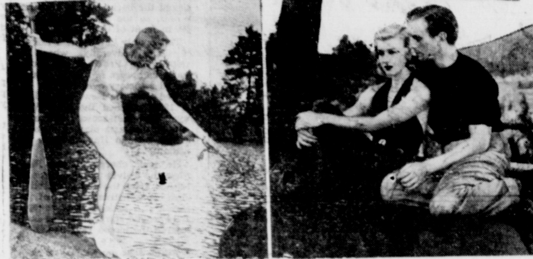
Summer vacation thrills without moving from your theatre seat is promised in "Having a Wonderful Time," co-starring Ginger Rogers and Douglas Fairbanks, scenes of which are shown above. At the upper left Ginger and Doug, Jr., look as if they are actually having a wonderful time; while at the upper right Ginger appears to be getting in trouble as another vacationist's boy friend is paying Rogers too much attention. At the lower left Ginger strikes a typical resort pose and at the lower right inevitable summer romance starts between Ginger and Doug, Jr. "Having a Wonderful Time" will be the attraction at the Lyric theatre for 2 days, starting Tuesday.