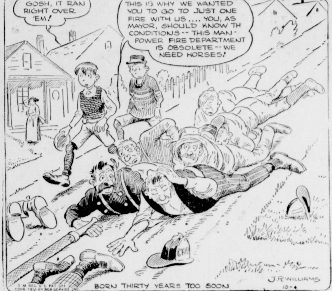
BORN THIRTY YEARS TOO SOON