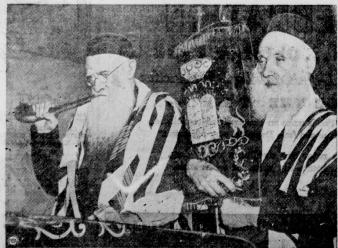
The ancient ritual of Rosh Hashanah, Jewish New Year, is performed in the above picture of two Jewish patriarchs officiating at the annual religious observance. One blows the "Shofar," or ram's horn, calling the Jews to penitence and reflection and one holds the holy scroll of "Torah" or Old Testament. Orthodox Jews celebrate the New Year two days, while reform temples limit the observance to one day. Yom Kippur, "Day of Atonement," climaxes the 10 days of penitence, which this year are from sunset, Sept. 25, to Oct. 4.