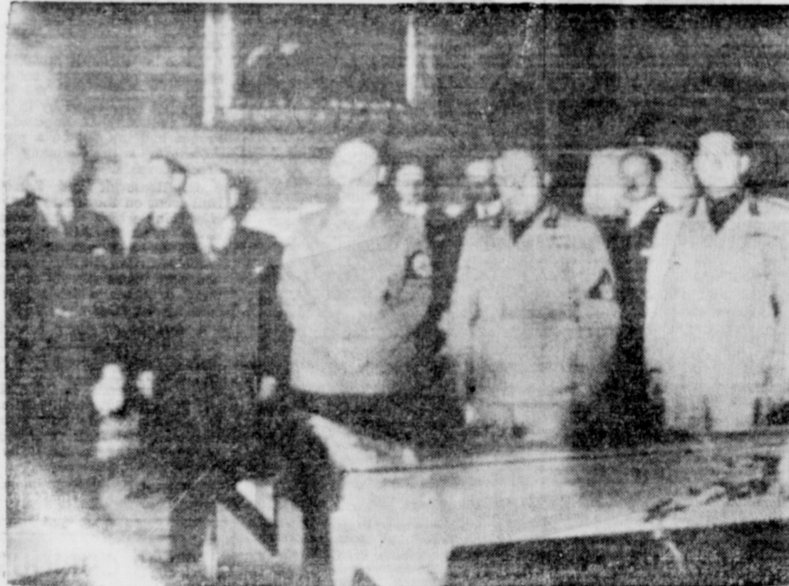
Peace or a frightful war depended on the eleventh-hour get-together, pictured above, of the four most powerful statesmen in Europe. This NEA Service radiophoto, flashed to the United States, shows (left to right) Prime Minister Neville Chamberlain, Premier Edouard Daladier, Chancellor Adolf Hitler and Premier Benito Mussolini at their historic meeting in the Fuehrerhaus in Munich, Germany, where they gathered at Hitler's invitation to find a peaceful way out of the Czech-Sudeten situation. The man at the extreme right is Count Galeazzo Ciano, Mussolini's son-in-law and Italian Foreign Minister.