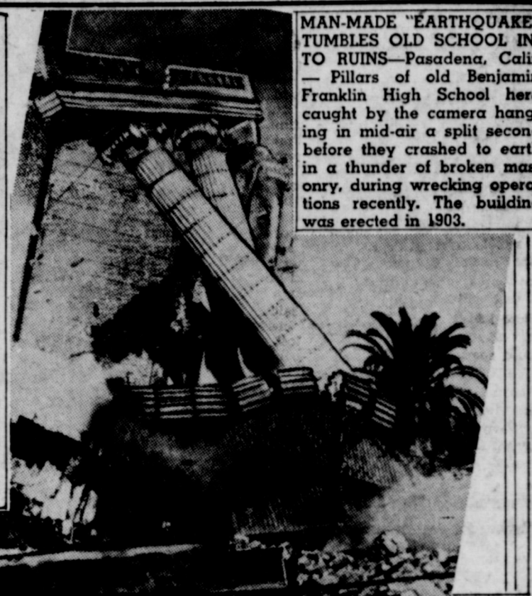
MAN-MADE "EARTHQUAKE" —TUMBLES OLD SCHOOL INTO RUINS—Pasadena, Calif.—Pillars of old Benjamin Franklin High School here caught by the camera hanging in mid-air a split second before they crashed to earth in a thunder of broken masonry, during wrecking operations recently. The building was erected in 1903.