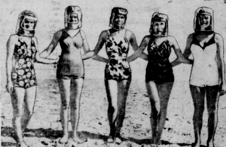
ANTI-FRECKLE HELMETS —Atlantic City, N. J.—Prepared to repel the effects of old Sol are these five pretty mermaids wearing oil-skin beach helmets, designed to protect them against freckles.