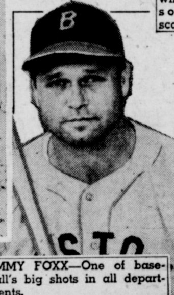
JIMMY FOXX —One of baseball's big shots in all departments.