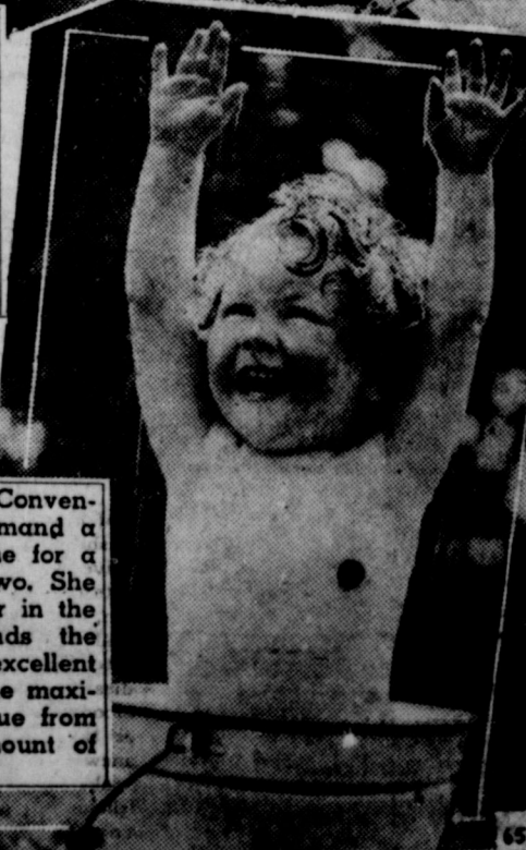
LUCKY GIRL —Convention does not demand a swimming costume for a little girl aged two. She can take a cooler in the garden, and finds the enamel pail an excellent way of getting the maximum cooling value from the minimum amount of water.