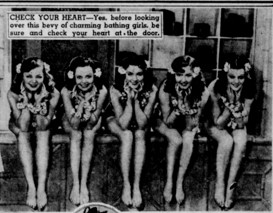
CHECK YOUR HEART —Yes, before looking over this bevy of charming bathing girls, be sure and check your heart at the door.