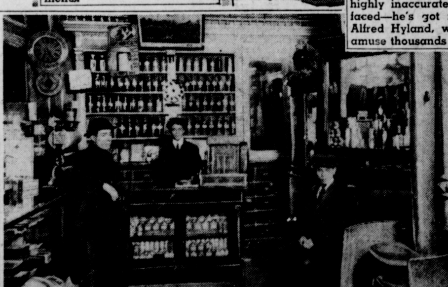
THOSE DAYS ARE GONE FOREVER —With modern drug stores all across the country preparing to celebrate Nationally Advertised Brands Week the first of September. Consumers Information dug this picture from its files as a reminder of the drug stores of a generation and more ago. Development of nationally advertised brands, it points out, protects the consumer against many former dangers, in addition to saving him money.