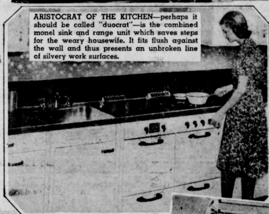
ARISTOCRAT OF THE KITCHEN —perhaps it should be called "duocrat"—is the combined monel sink and range unit which saves steps for the weary housewife. It fits flush against the wall and thus presents an unbroken line of silvery work surfaces.

(1) New York, N. Y.—A hint of Oriental allure, this evening dress of forest green lame, faintly shot with silver, and trimmed with vivid pink. (2) Paris—Smart, streamlined mantle of delightful black and yellow print. (3) Paris—This smart new beach costume of bright rust-colored linen with dark blue and white leather accessories and neck scarf.