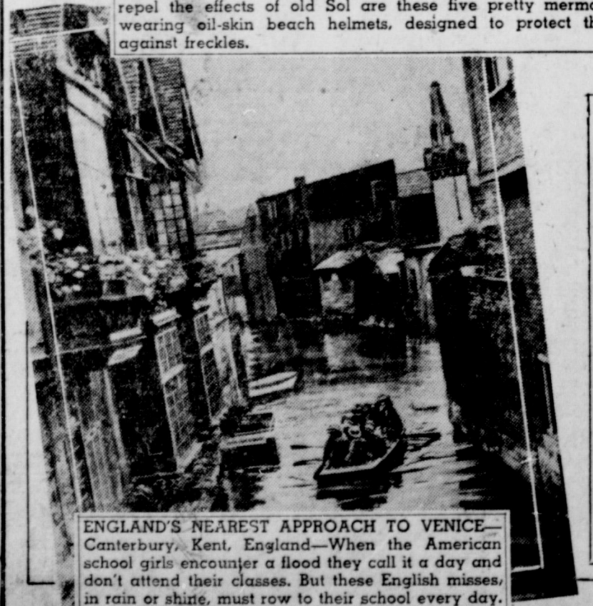
ENGLAND'S NEAREST APPROACH TO VENICE —Canterbury, Kent, England—When the American school girls encounter a flood they call it a day and don't attend their classes. But these English misses, in rain or shine, must row to their school every day.