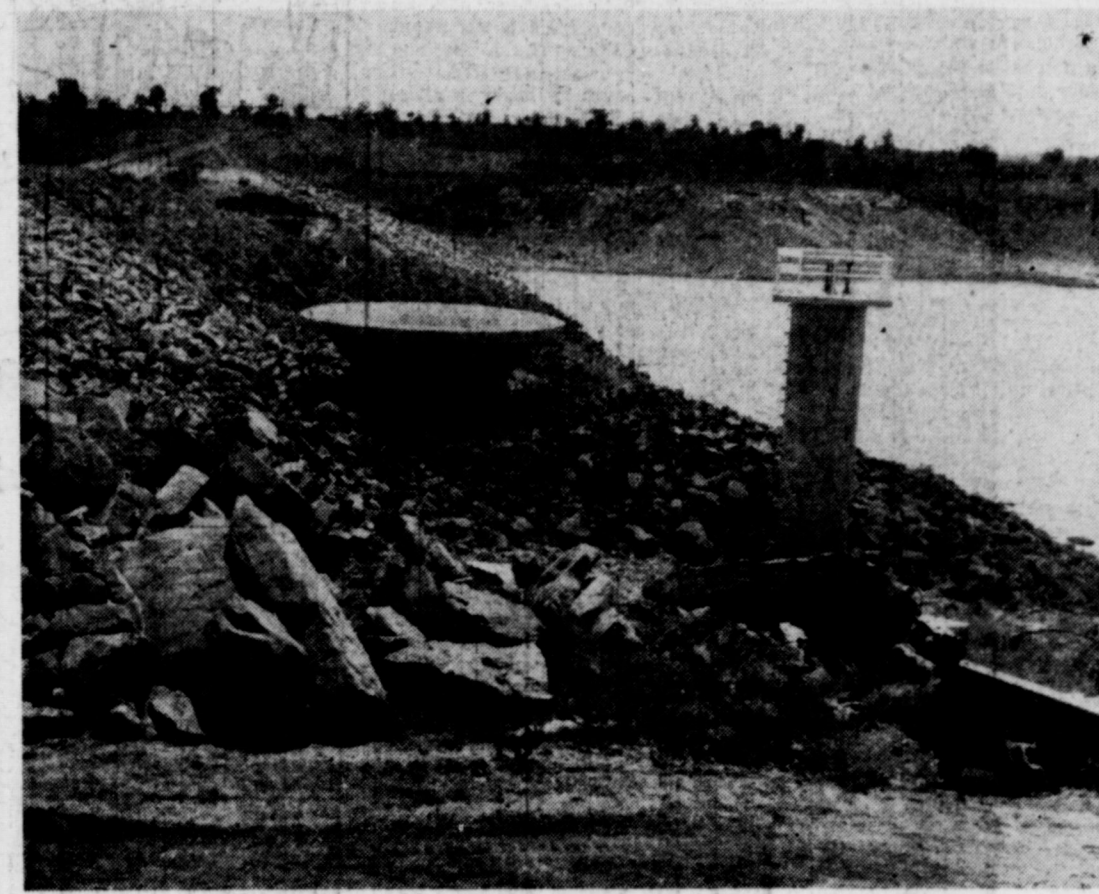
BACKING UP WATER—The new Ranger-Eastland lake on the Leon River has already begun forming back of the huge dam built by the Eastland County Water Supply District. The picture above was taken facing south. The coin shaped cement work at left is the overflow valve and the tower at right is the safety valve. The gap which is at present being filled can be seen in the center of the picture.

Others indicted at the same time was Silbey Carroll Tipton, for the same offense, and William Lewis Robertson, on a narcotic charge.