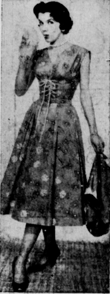
A sundress with its own jacket patterned all over with flowers. Bright, white pique trims the brief jacket and laces the midriff of the bare dress with full circular skirt.