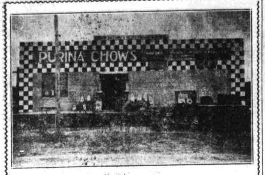
Above cut represents our big